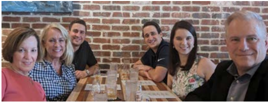
Somewhere along the way, we discovered monthly whiskey dinners...