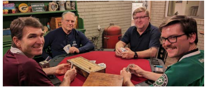
Cribbage Night on the Patio

Back in action! The traditional New Year's Eve gathering of our "Wineaux" Group at our home went off without a hitch, as distinguished from the misfires of the last two years. This crowd has been getting together now for over six years, during which time we have tasted over 160 varieties of grapes (plus Lord knows what else). On to 2023!