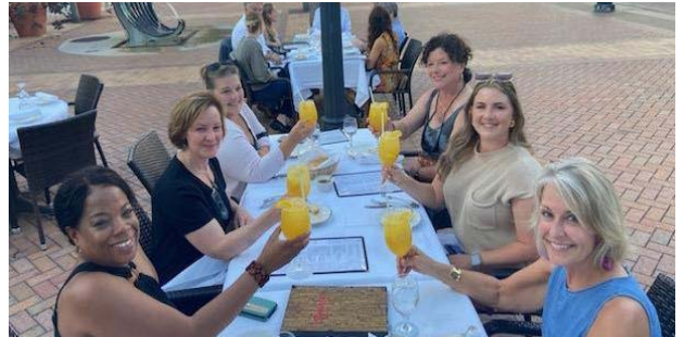
Ladies in Florida